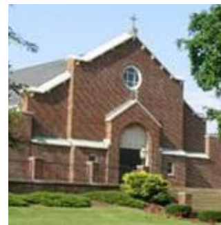
Saint Barbara Campus 2813 Lincoln Way NW Massillon, Ohio 44647 saintbarbaraparish.com

National Shrine of Saint Dymphna and Gift Shop 206 Cherry Rd NE, Massillon, Ohio 44646 - (330) 833-8478