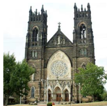
Saint Mary Campus 206 Cherry Road NE Massillon, Ohio 44646 stmarymassillon.com

The Fourth Sunday of Ordinary Time January 29, 2023