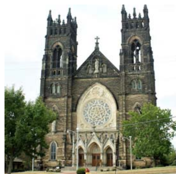
Saint Mary Campus 206 Cherry Road NE Massillon, Ohio 44646 stmarymassillon.com

The Second Sunday of Ordinary Time January 15, 2023