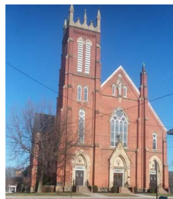
Saint Joseph Campus 322 Third Street SE Massillon, Ohio 44646 sites.google.com/stjosephmassillon