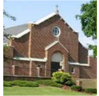
Saint Barbara Campus 2813 Lincoln Way NW Massillon, Ohio 44647 saintbarbaraparish.com

206 Cherry Rd NE, Massillon, Ohio 44646 - (330) 833-8478