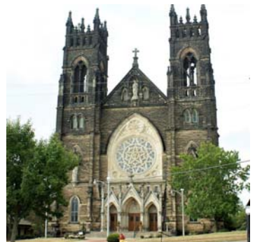
Saint Mary Campus 206 Cherry Road NE Massillon, Ohio 44646 stmarymassillon.com