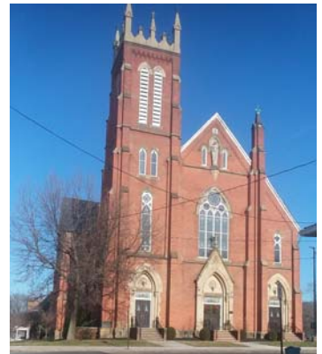
Saint Joseph Campus 322 Third Street SE Massillon, Ohio 44646 sites.google.com/stjosephmassillon